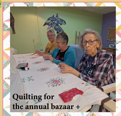
Quilting for the annual bazaar +

31st- Sunday worship at UFR 8:30am & CLC 10:30